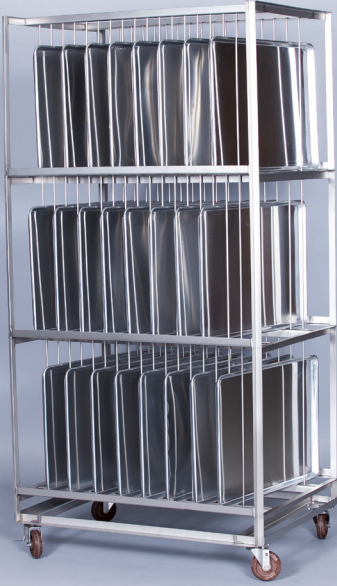
Sheet Pan Rack